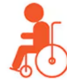
People with disabilities